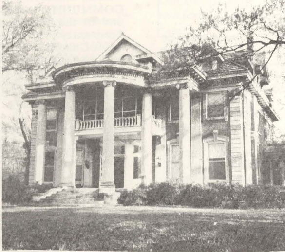
The Galloway Mansion

The house itself combines several different architectural styles resulting in what might best be described as "modified Greek Revival." It features four Ionic columns enclosing a semi-circular porch and supporting a second-floor balcony from which one can survey the grounds and beyond. Above this is the ballroom which covers the entire third floor (and is temporarily partitioned into rooms). In its construction steel was used freely, something not often done in residential buildings, to reinforce the floors and as interior trim.