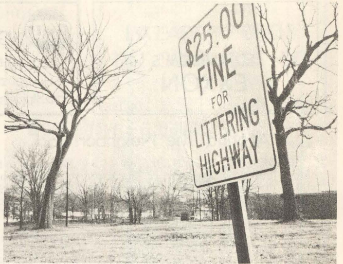
Highway or no, this sign near Overton Park Avenue points to a need for constructive planning for this wooded corridor through Mid-town.

Tickets are $3.00 for adults and $1.50 for students and can be obtained at the door or by sending a stamped, self-addressed envelope to Dilemma '74 in care of Southwestern.