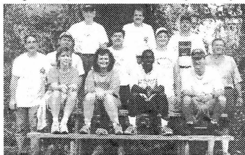
FedEx employees on Cypress Creek Bike Trail (east end) sitting on rebuilt picnic table.