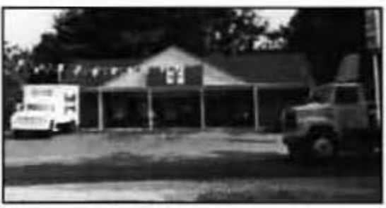
Before: Prior to VECA purchasing the building in 1996, it was operating as a 7-11 convenience store