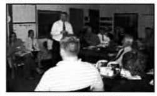
October 6 meeting at VECA office

Accordingly, VECA will host a free public meeting at the VECA office (1680 Jackson Avenue) at 6:00 p.m. on Wednesday, November 17. Come to find out the pros and cons of Superfund designation, and help shape our important decision.