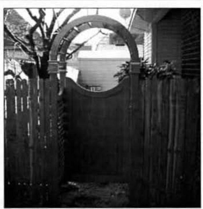
Arbor and gate made from 120 year old Eastern Red Cedar salvaged from the Morning Sun Cemetery after the 2003 storm

I invite you to visit our updated website at www.scottbanbury.com and I look forward to the opportunity to serve your future custom sawing, lumber or woodworking needs. If you are interested in any of the services we offer, please email me at sbanbury@midsouth.rr.com or call 619-8567.