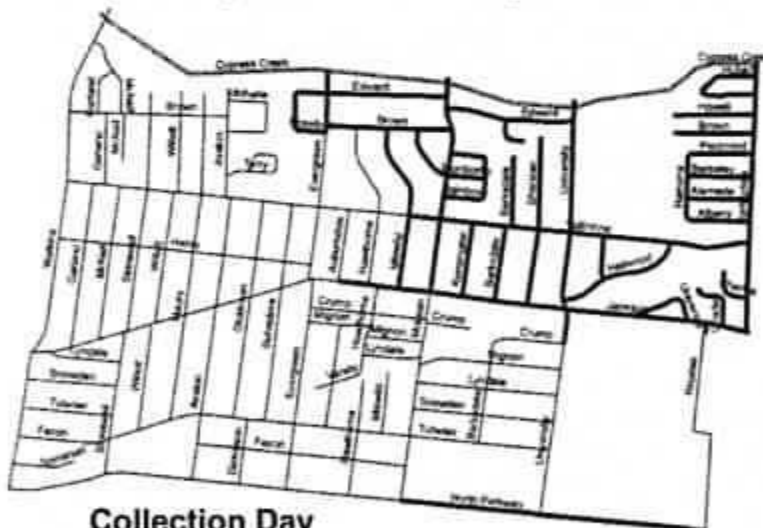
City of Memphis Solid Waste Management Routes

Now that spring has arrived, a few Vollintine-Evergreen residents need to be reminded that their trash should be placed at the street on their own property. Whenever possible, trash should be in the city's bin or in plastic trash bags. Trash bins and recycling bins should be left at the curb for no more than 24 hours, from 7:00 p.m. the evening before pickup to 7:00 p.m. the evening of pickup. No trash or construction debris should ever be left on city-owned property. If you see violators, contact the VECA office with as much information as possible: location, date and time, type of trash dumped, description of violator, license plate number, etc.