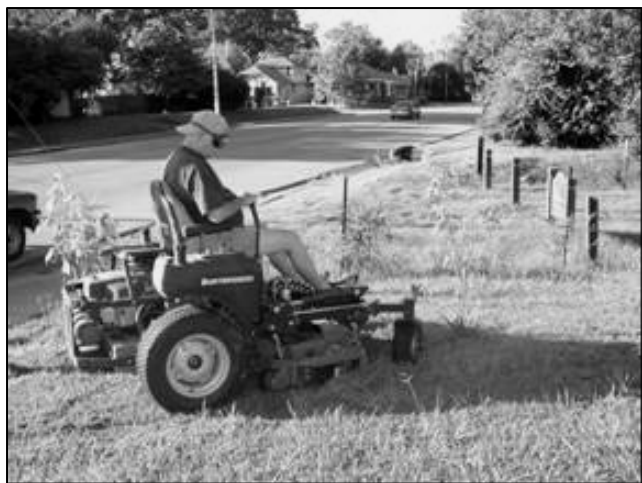
There are now eight volunteers mowing the Greenline and two contractors supplement their work with weed eating and trimming.