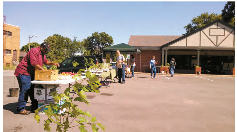
ABOVE: Fresh produce being offered for sale at the Welcome Center

Have an idea for a fun activity for a first Saturday? Let us know. Email sampow@gmail.com