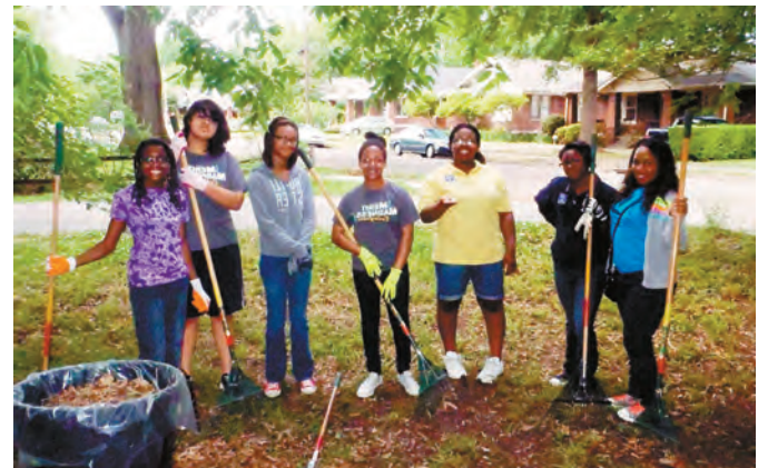
BELOW AND TO THE RIGHT: Student volunteers from Collegiate School donated several hours working on the Greenline.

Collegiate School of Memphis 3353 Faxon Avenue, Memphis TN 38122 901.591.8200 phone | 901.591.8297 fax www.collegiatememphis.org