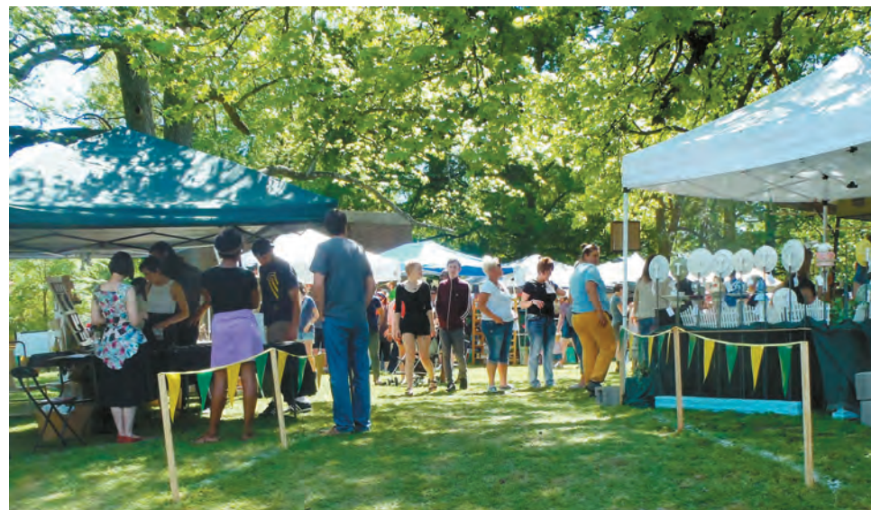
Top: The entire Kirby Family was involved in the 2014 Artwalk Bottom: Several hundred people and 40+ vendors enjoy Artwalk 2014