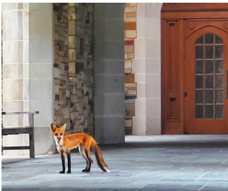
A fox living the high life at Rhodes as the campus remains unusually quiet in late July.

We will run a similar article in the next issue and we would love to know how you are coping with the pandemic. Send us your story via the link below. https://forms.gle/rqo22ZqcEEPZNUkt9