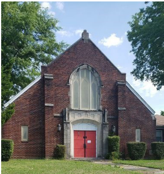
Peace Lutheran Church