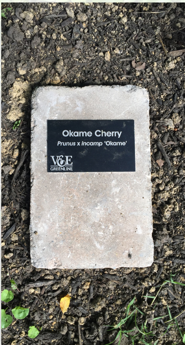
New markers inform Greenline users of the multitude of tree species along the trail.

From a project that began more than three years ago, the V&E Greenline Arboretum is nearing completion — and Level 2 certification — along the 1.7 mile trail. The V&E Greenline has long been a favorite place in the community, experiencing an enormous jump in use since the outbreak of COVID-19.