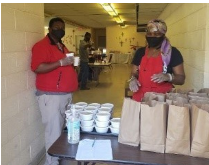
Volunteers serving at Peace Lutheran Church.

Located at the corner of Jackson and Willett, Peace Lutheran Church in Memphis has ministered to the midtown community for over 100 years. A beautiful brick building with stained glass windows, it continues to serve its members and the community, even amidst the chaos of Covid-19 and the loss of its pastor, through online Sunday services and distance sensitive outreach.