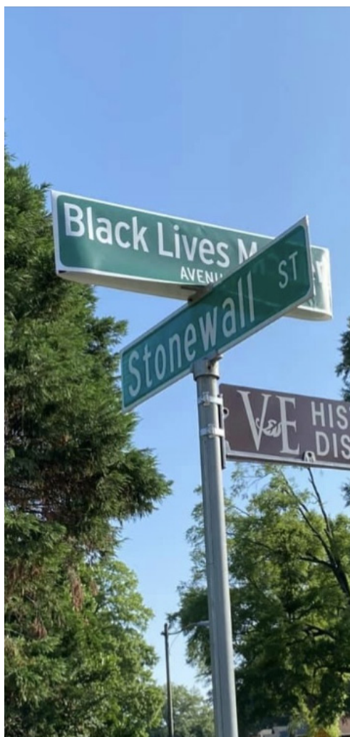
"Black Lives Matter" signage was temporarily installed at various intersections.

While walking my dog, I passed a neighbor on Jackson Avenue who had come to help her elderly neighbor get her trash can out for pickup. She was talking about "Black Lives Matter Avenue" and went on to share the news with everyone else she saw, from the sanitation workers to a passing cyclist: her street had been renamed overnight. I looked up to see the Jackson Ave. sign replaced with Black Lives Matter Ave., and thought about the symbolism of this renaming.