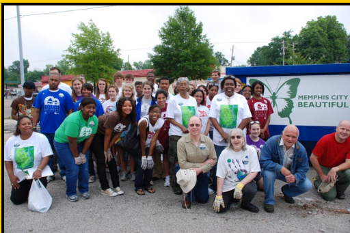
A block club working together to cleanup their street during Dumpster Day .