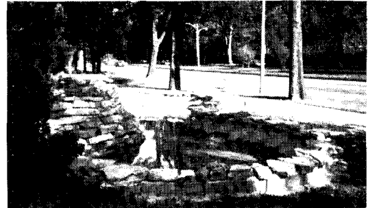
New Parkway House Fountain

the complex opened, will be given first opportunity to buy a condominium. The price of the units has not been announced.