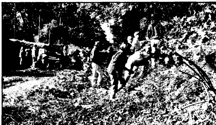
Rhodes students attack kudzu vines on the L&N during clean up day.