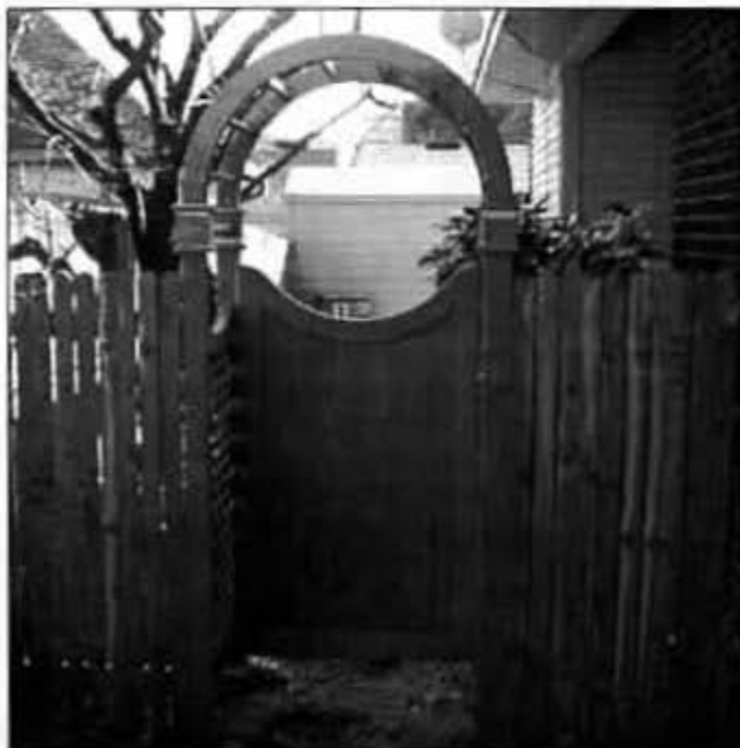
Arbor and gate made from 120 year old Eastern Red Cedar salvaged from the Morning Sun Cemetery after the 2003 storm

I invite you to visit our updated website at www.scottbanbury.com and I look forward to the opportunity to serve your future custom sawing, lumber or woodworking needs. If you are interested in any of the services we offer, please email me at sbanbury@midsouth.rr.com or call 619-8567.